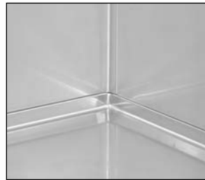
Detail of radius corner and tanked bottom