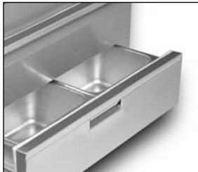
Detail of Standard Drawer