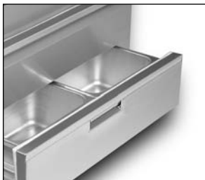
Detail of Standard Drawer